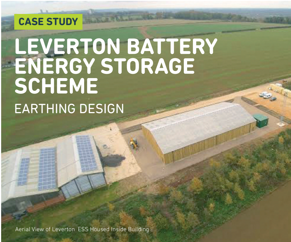
Aerial View of Leverton ESS Housed Inside Building